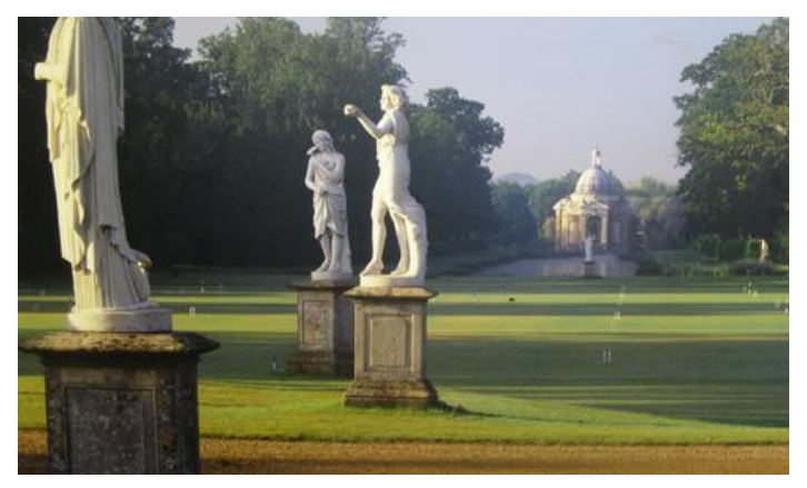
It may only be an illusion, but how nice it must be for a statue to be able to look the other way.

I asked EH about obtaining a copy, and you can imagine my surprise when I was told that the photo, taken in August 2002, had been flipped. The sun is rising rather than setting, and play is not over but has yet to start.