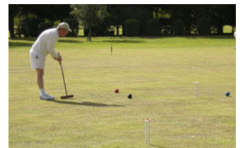
4. The peel and hoop approach