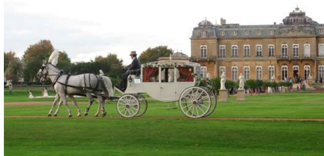
Putting the cars before the horses: forms of transport seen at the wedding on Sunday 11 September.