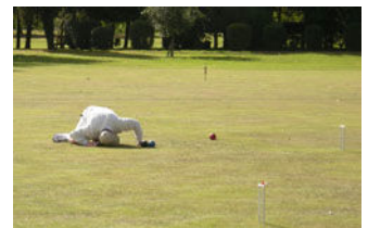
2. The final alignment