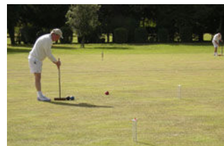
3. The address