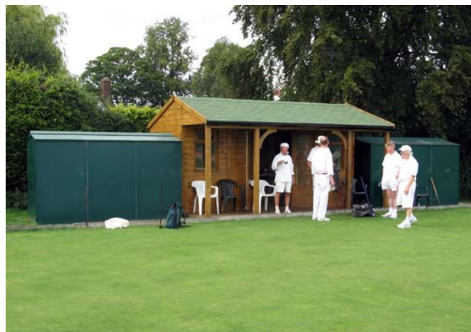
The Letchworth clubhouse and equipment sheds.