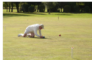
1. The initial positioning