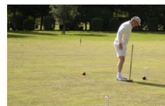
5. The deleted expletives