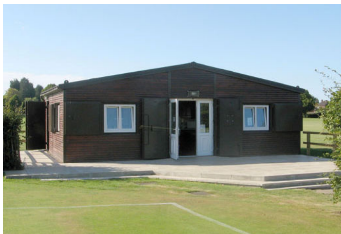
The Chester clubhouse, showing the heavy steel covers for the doors and windows.