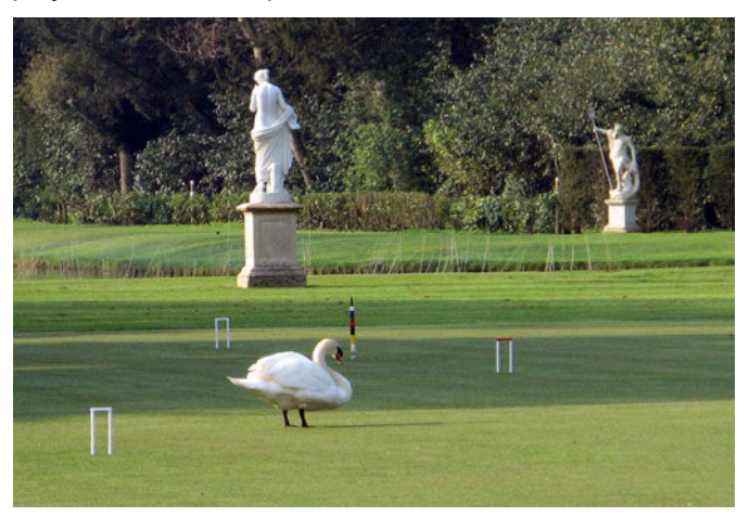
Landscape with figures.

This event was the best yet in terms of numbers, with 18 players – see the report on the EACF website.