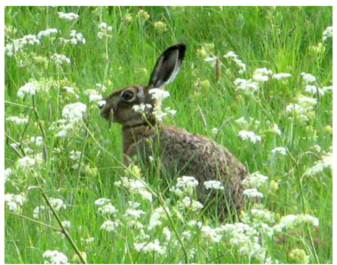
Coots on the Long Water (7 May) and a hare in the meadow (12 May)