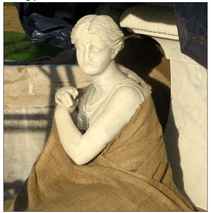
Warm enough to melt a heart of stone, this cloak by Hessian is the latest in refugee chic. The waterproof bubble-wrap lining makes it an ideal garment for anyone who has to be out in all weathers.