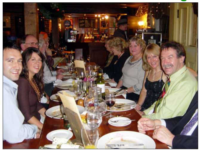
The photo in the last issue rather neglected those on the far table, so here they are.