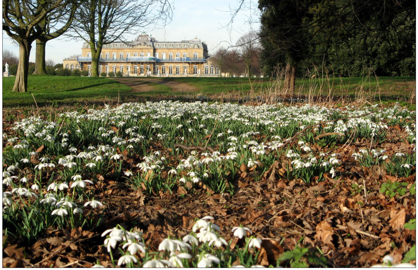
Three secondary colours to the fore on a spring-like early February afternoon.