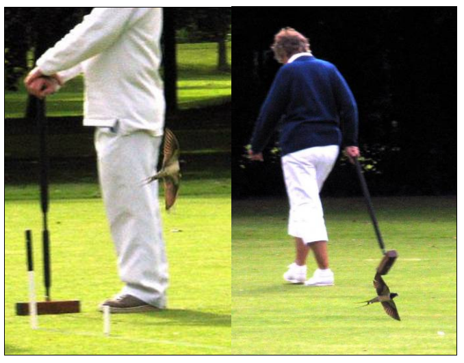
Watch the birdie: swallows caught at an exposure of 1/1000 sec

As is so often the case at Wrest Park, the croquet was a backdrop to the activities of the local wildlife. For most of Friday the lawns were occupied by a large number of swallows who were tearing back and forth at high speed and zero feet. They were feeding on small yellow insects (probably yellow mayflies) and it was not uncommon for a bird to suddenly swoop up and appear to feed another in mid-air, twittering all the while.