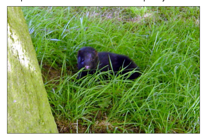
Here's looking at you, kit. A young mink photographed by John Wheeler during the July tournament.

At the airport Ben and Rod were able to see exactly where the weights are in their mallet heads, courtesy of a kindly and not too busy X-ray machine operator - what will they find to blame next? Altogether a very enjoyable trip and our thanks to everyone we met at Jersey Croquet Club for their kindness and hospitality.