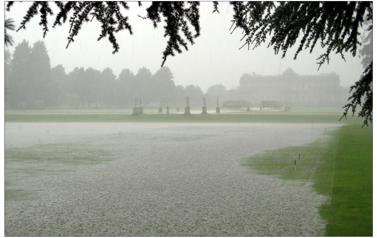
Heavy weather - the lawns at 5.35pm on Thursday 14th June, with forty hours to go before the start of the Home Internationals.